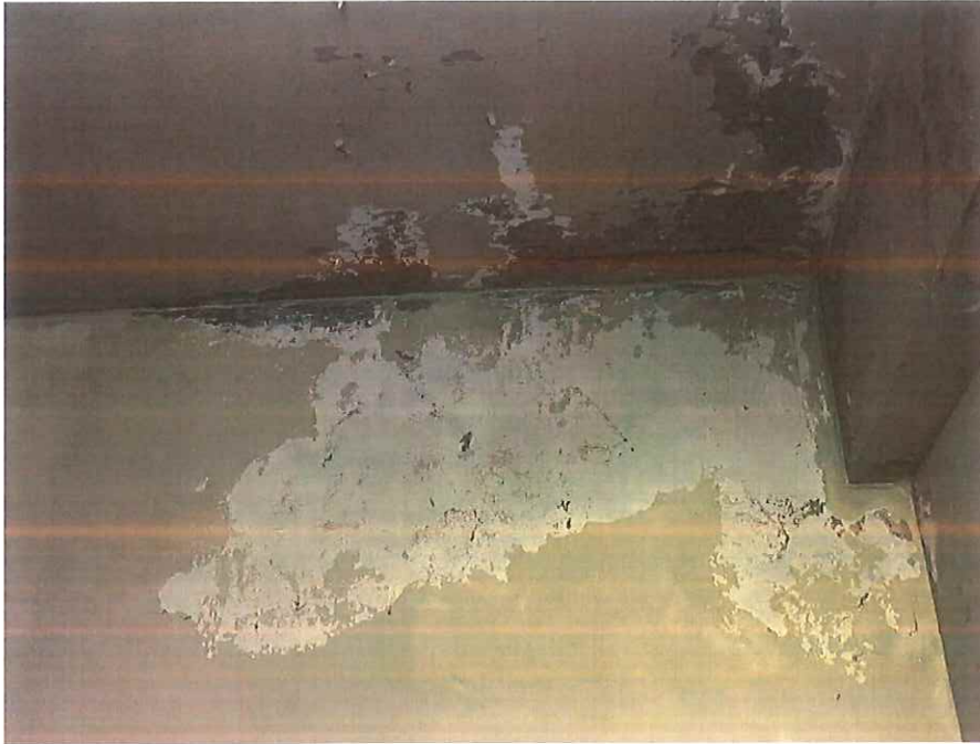
Foto 5: El plantel tiene problemas de filtraciones alrededor de todos los edificios.