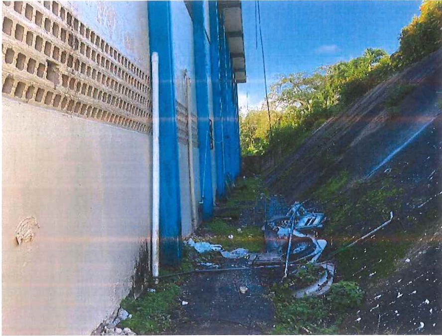
Foto 1: Al rededor del patio del plantel hay escombros de maquinaria de aire acondicionado tirados y cables colgando del techo.