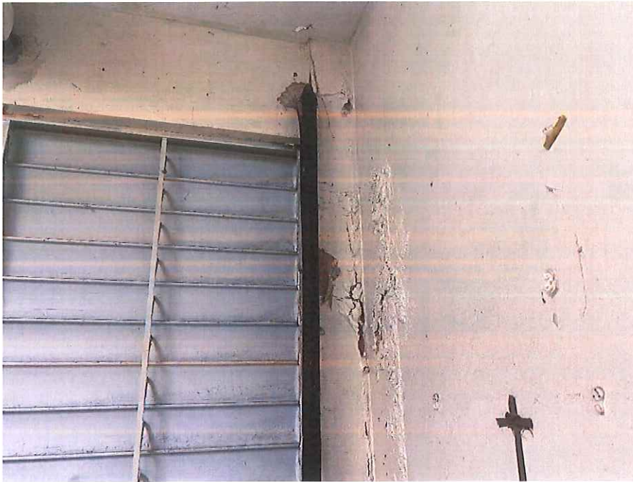
Foto 6: El plantel tiene problemas de filtraciones alrededor de todos los edificios.