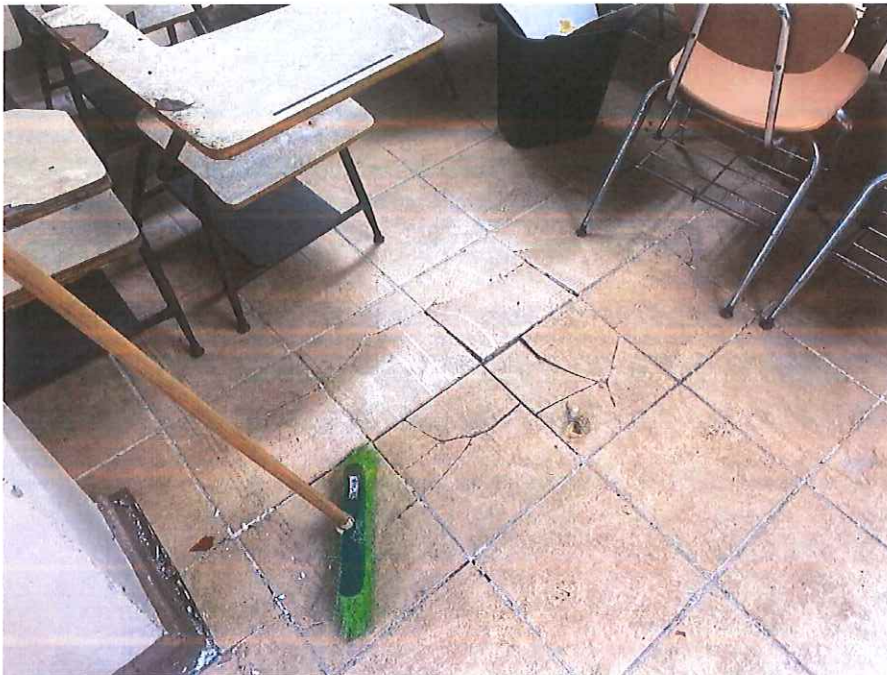
Foto 4: Salón de economía doméstica, el cual ya está clausurado, tiene las losas del piso levantadas y rotas.