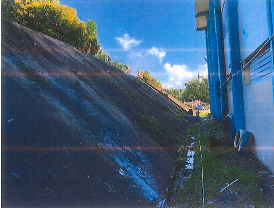
Foto 3: Al rededor del patio del plantel hay escombros de maquinaria de aire acondicionado tirados y cables colgando del techo.